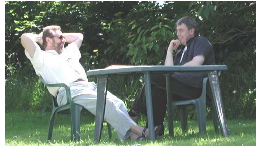
During a Cursillo weekend June 2003