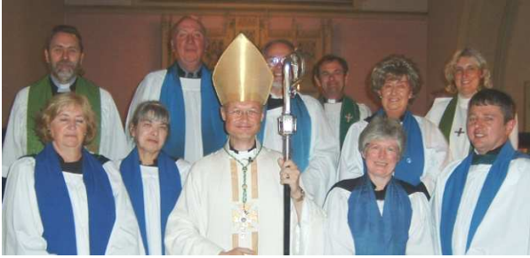
Readers being authorized for funerals June 2007