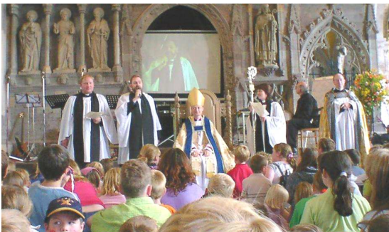
Diocesan Children's Festival September 2002