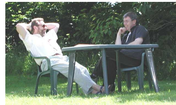
During a Cursillo weekend June 2003