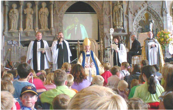
Diocesan Children's Festival September 2002