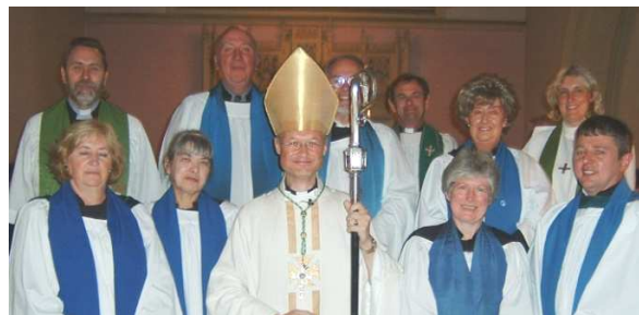
Readers being authorized for funerals June 2007