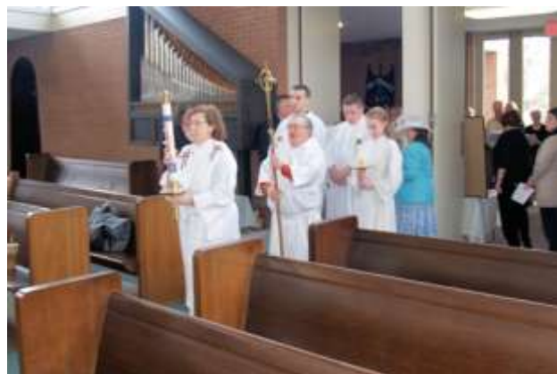
Easter at Christ St. Mark