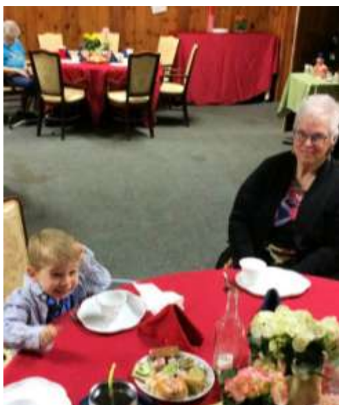
Tea Party Fundraiser